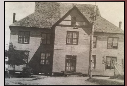
L-R: Inside the first designated Boaz school; the Boaz Public School, 1924, later Boaz Elementary School, 1961; the second Boaz High School, 1903-1924.