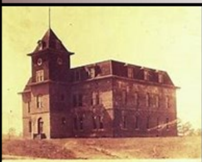
JOHN H. SNEAD SEMINARY

Sned Seminary provided higher or high school level education. A “third” Boaz High School was constructed on Thomas Avenue, beginning in 1936. Boaz High School was located there until the new, and current high school was opened on Brown Street in 1961. With three buildings now existing, they were named Boaz Elementary, Boaz Junior High, and Boaz High School.